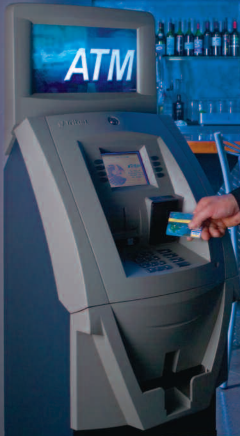
8100 with backlit topper