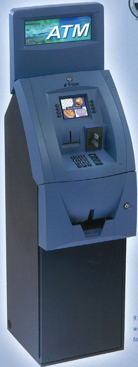
9100 in blue with backlit topper