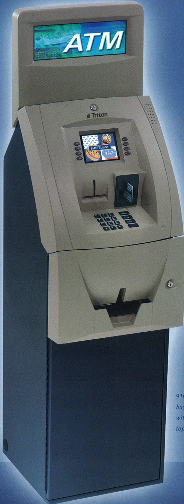
9100 in bayou bronze with backlit topper

The 9100 is our best selling ATM. This extremely popular machine was designed to be the lowest cost high-performance ATM in the industry. And it has proven to be perfectly suited for owners who need functionality and performance at a lower price point.